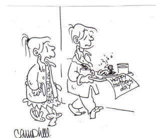
"I hope she recognizes this as a labor of love. She's not gonna recognize it as breakfast."